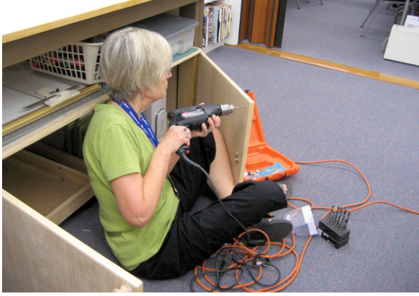
Don't mess with me!