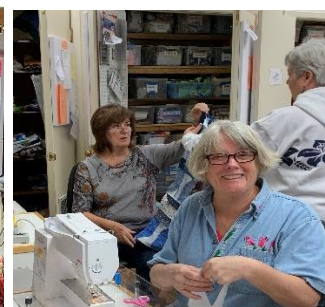
Lots of busy people at the December Quiltathon. Everyone is welcome—beginners to advanced!