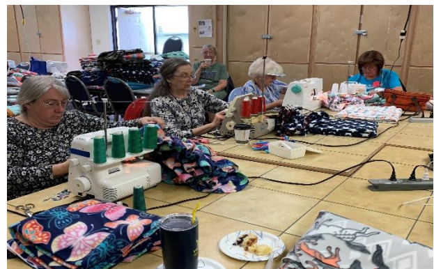
Salvation Army Blanket Day, December 2019